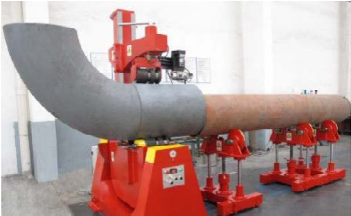
Torch bracket and oscillator (tonch screen is mounted on the control pendant)